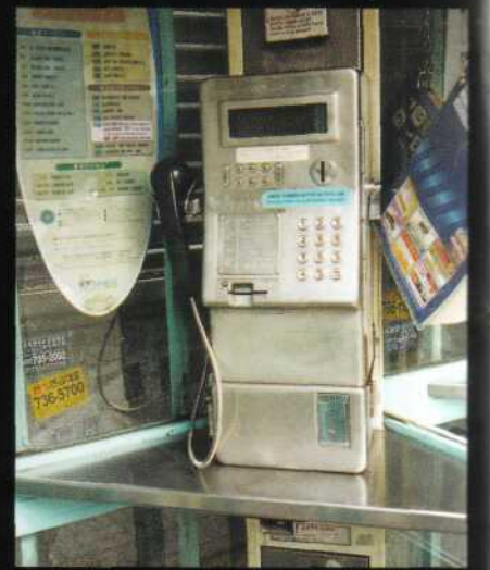
Seoul. A coins-only version, also fairly common and usually found near the cards-only phones.